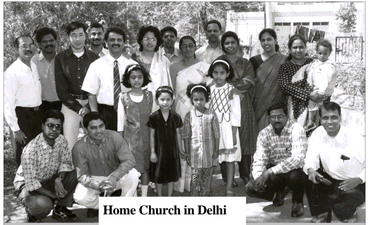
Home Church in Delhi