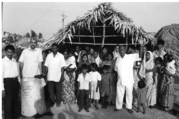
The dedication service for a newly built mud-hut home/church in Andra-Pradesh

After spending the evening and the following day with him, we left him some literature and boarded the train for Vijayawada. Upon our arrival at the