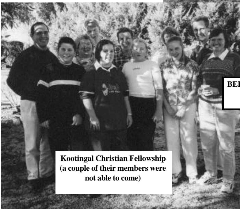
Kootingal Christian Fellowship (a couple of their members were not able to come)

BELOW The serious side of fellowship that includes great feats of Christian charity - and some not so great!